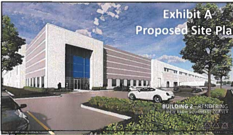
Exhibit A Proposed Site Plan