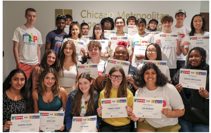
2023 FLIP students who completed their immersive planning experience

To gauge employee perceptions of workplace and culture, we conducted an inclusion survey in 2023. An impressive 83 percent of CMAP employees completed the survey, exceeding the team's goal response rate and demonstrating a high degree of engagement. The response rate marked a dramatic improvement over the 33 percent response rate for the 2021 inclusion survey. The survey findings were encouraging and provide clear direction as we continue to foster an inclusive culture through social events, internal communications and engagement, and recommendations for DEI Roadmap projects.