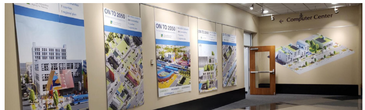
ON TO 2050 exhibition at the Gail Borden Public Library in Elgin

The ON TO 2050 regional plan came to life in an exhibit that traveled from the Dunn Museum in Libertyville to the Gail Borden Public Library in Elgin to Waubensee Community College in Aurora. CMAP thanks the team at the Lake County Forest Preserves who created the interactive exhibit, as well as all the exhibit's regional hosts.