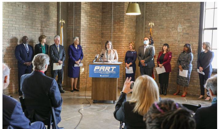
Regional leaders gather to deliver the Plan of Action for Regional Transit

CMAP has risen to the task set before it and has prepared a strong report on a difficult issue.