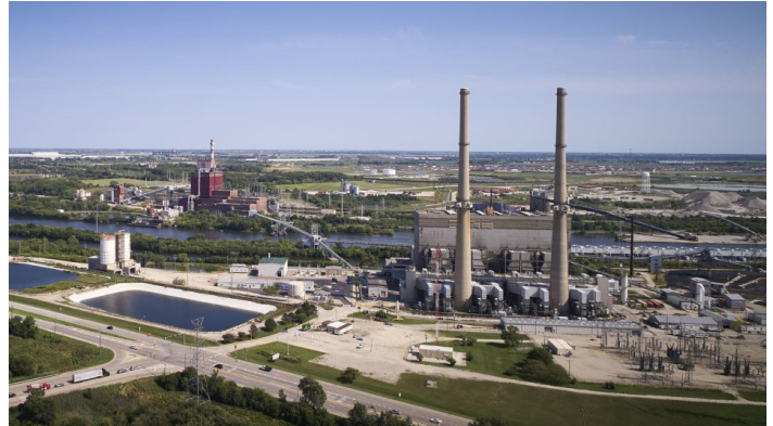
CMAP and its partners are collaborating on GHG emissions reduction measures

With these partners, CMAP will be able to better inform its work around regional climate action planning to establish transportation emission reduction targets. And most importantly, help the region attain its climate goals and substantial health benefits for its communities.