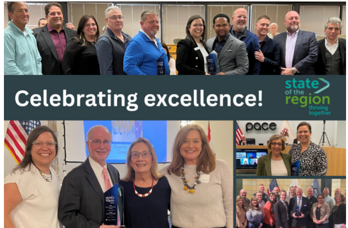
Handing out Regional Excellence Awards to our 2023 winners

In the survey, most residents said their neighborhood and town, village, or city is heading in the "right direction." But they are more critical of metropolitan Chicago and Illinois. Residents also showed support for more equitable transportation investments, regional collaboration, and local action on climate change.