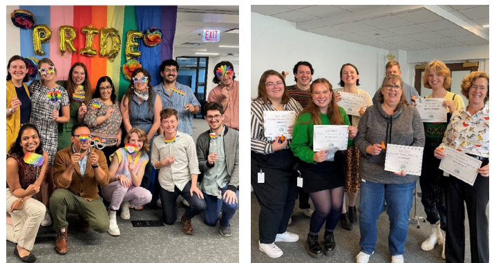
CMAP team members celebrating together