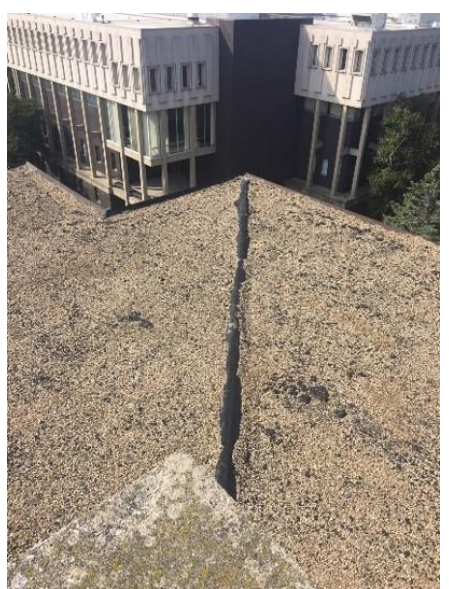
Water infiltration on roof