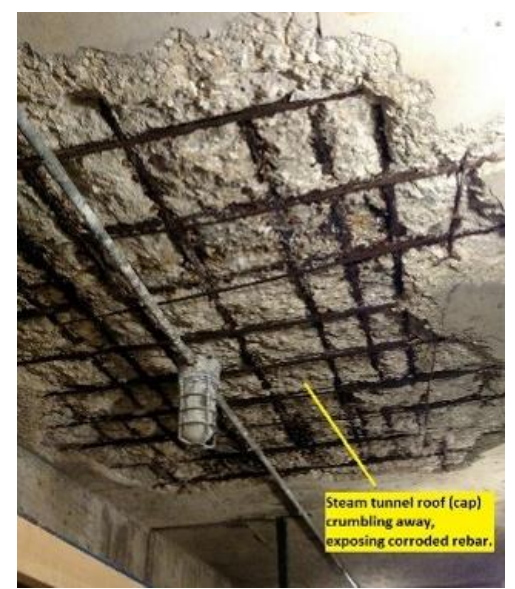
Steam tunnel cap damage with exposed and corroded rebar