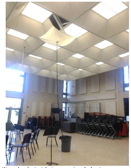
Ceiling leak (with improvised drainage system)