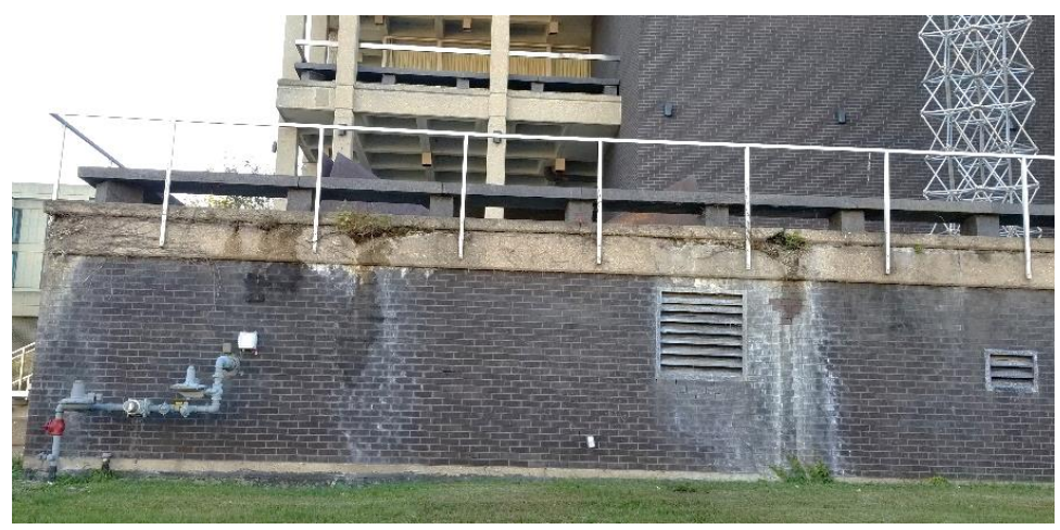
Water damage leading to structural failures