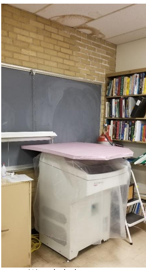
Water leak above cryostat (laboratory equipment)