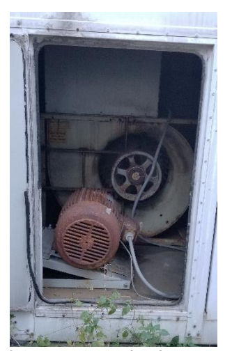
Nonfunctioning pool exhaust system