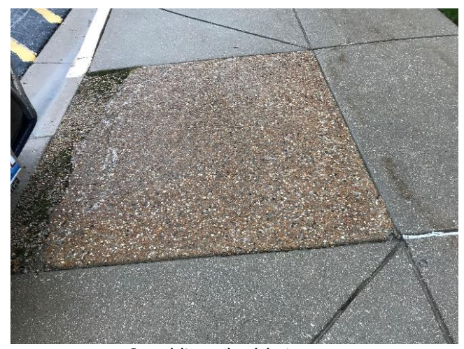
Crumbling wheelchair ramp