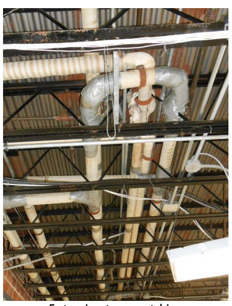
Extensive tape patching