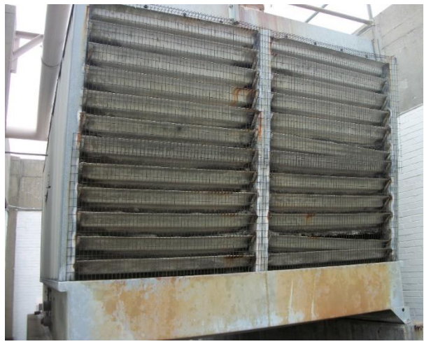
Corroded cooling tower