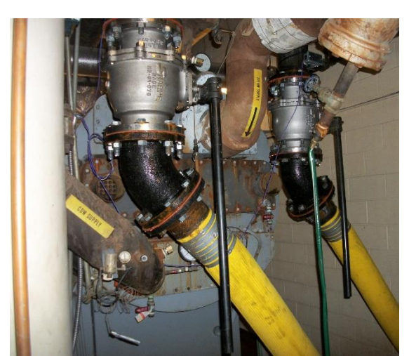
Temporary chiller hook up