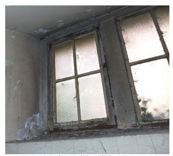
Window and drywall damage