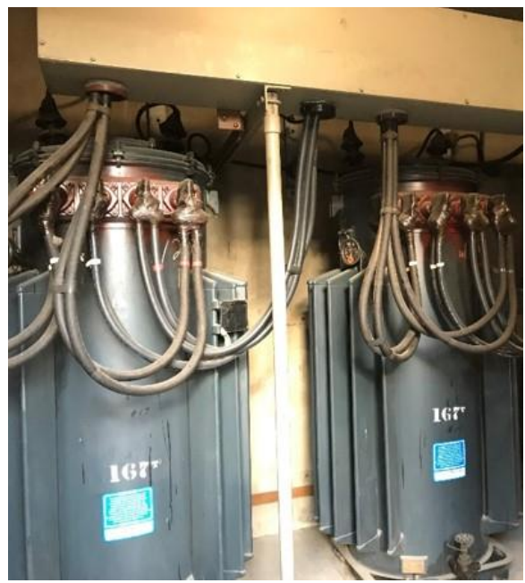
Transformer from the 1950s (with exposed live copper)