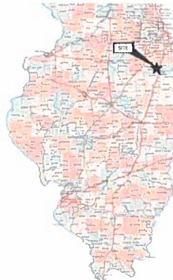
STATE ILLINOIS MAP (NOT TO SCALE)