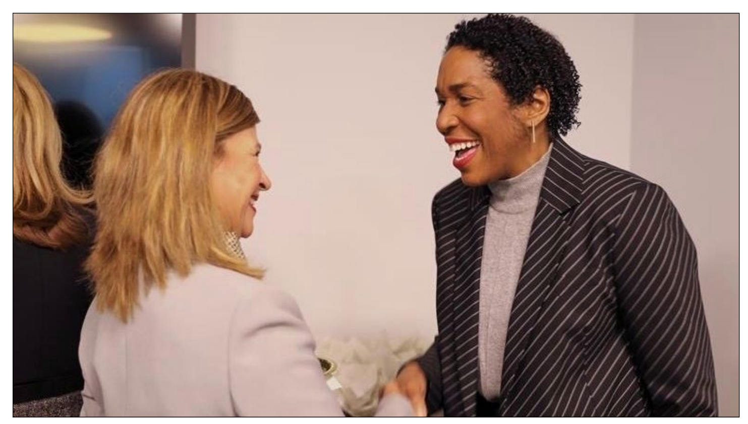
Lt. Governor Stratton greeting a supporter – October 2023