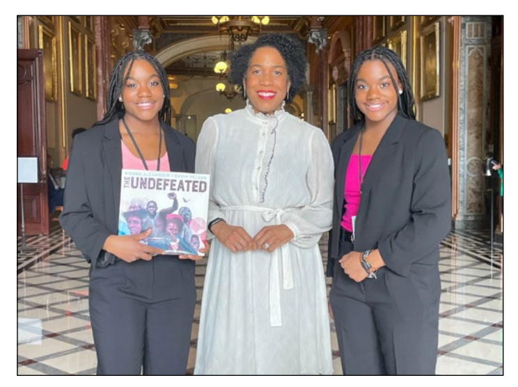
Lt. Governor Stratton, center, with twin sisters Kyra and Phallon Pierce – March 2023

Convening both virtually and in person, the Council carried forward recommendations, continued key topic conversations, and began to plan for future initiatives through its sub-committees. These four issue-based committees are: 1) Gender-Based Violence, 2) Health & Healthcare, 3) Leadership & Inclusion, and 4) Academic & Economic Opportunity. The committees convened virtually between Council meetings to discuss how to advance their recommendations.